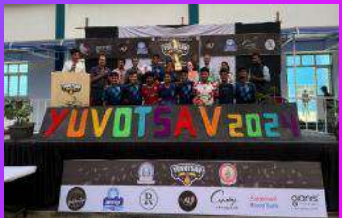
Inter-College Football Tournament "Yuvotsav - 24" organised by PCET's S. B. Patil Institute of Management, Nigdi. 32 teams were participated across from pune city and PCMC