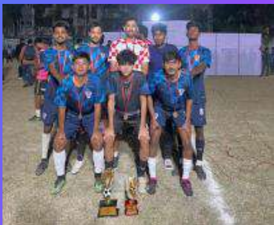
Winners at Sai Balaji Football League and also awarded the best player:- Stallion Arland 25 th to 28 January 2024